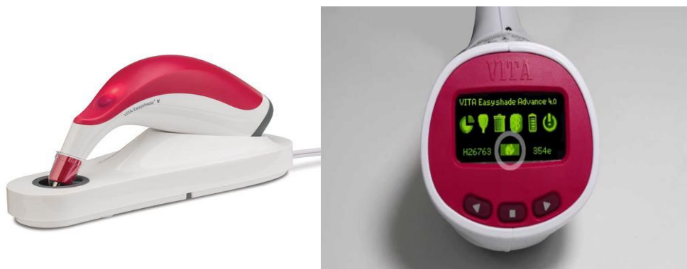
Figure 2. VITA easyshade [14]

The measurement of color changes on heat-cured acrylic resin plate in this study was using digital spectrophotometer (VITA Easyshade). (Figure 2). This instrument is the latest spectrophotometer used in clinical use [13].