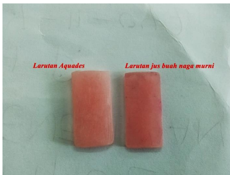
Figure 3. After 14 days immersion

The statistical test used in this study is the Non Parametric test which resulted in ordinal scale data. The results of the study were conducted with a descriptive test to study which group had the greatest potential in causing acrylic resin plate discoloration (Figure 3)