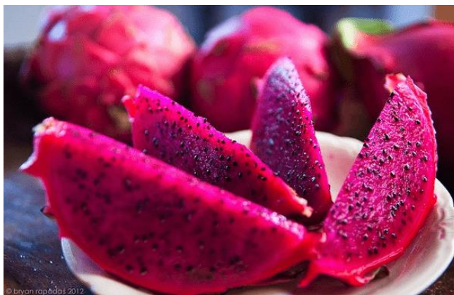
Figure 1. Red Dragon Fruit

There are four types of dragon fruit that have been cultivated in Indonesia, namely white flesh dragon fruit ( Hylocereus undatus ), red meat dragon fruit ( Hylocereus polyrhizus ), super red meat dragon fruit ( Hylocereus costaricensis ), and white flesh yellow dragon fruit ( Selenicereus megalanthus ). A hundred grams of red dragon fruit ( Hylocereus polyrhizus ) flesh contains water (82.5-83.0 g); protein (0.16-0.23 g); fat (0.21-0.61 g); niacin (1.29-1.30 mg); vitamin C (8.0-9.0 mg); sweetness level of 13-15 briks; and anthocyanin as much as 8.8 mg [7-10].